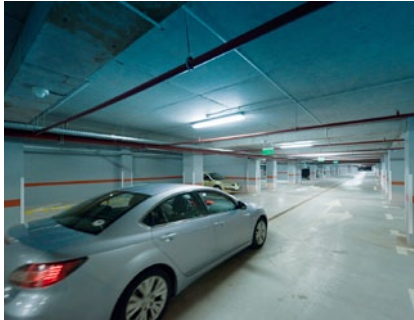
Monitoring in underground garages (safety)