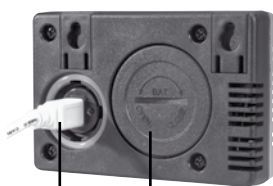
USB-Mini port (settings and data download) Battery compartment